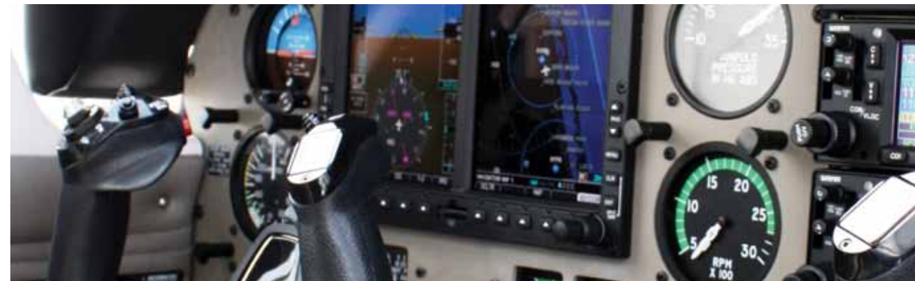
Standard Equipped List Price: $617,000*