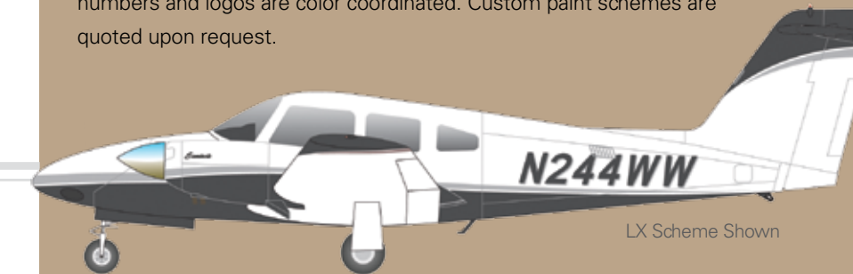
LX Scheme Shown

The 2012 Seminole Exterior Styling utilizes a DuPont Imron polyurethane white paint base and choice of two fuselage trim colors. Registration numbers and logos are color coordinated. Custom paint schemes are quoted upon request.